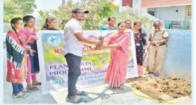
మహిళా మొక్కను అందజేస్తున్న శ్రీరామ విద్యార్థులు