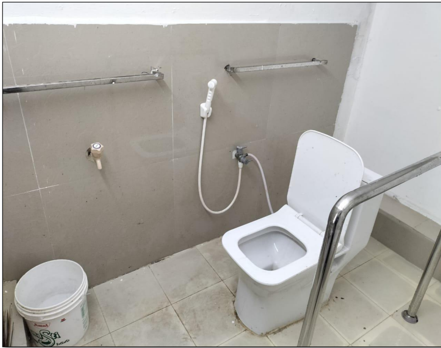
Wash Rooms for Divyangjan