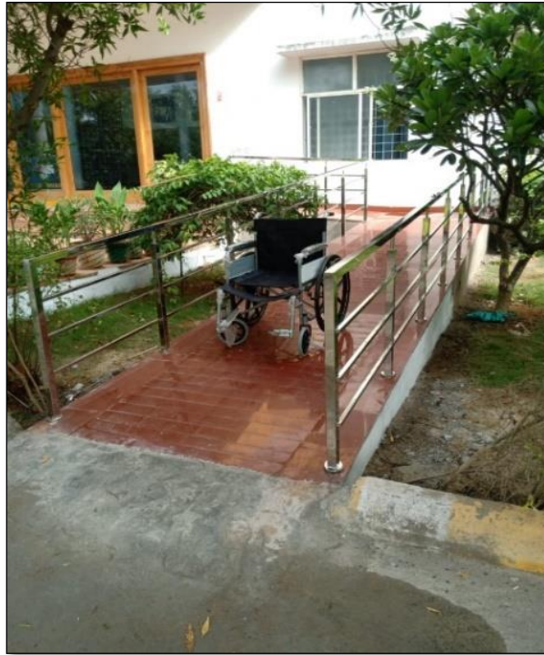
Ramp Facility with Rails