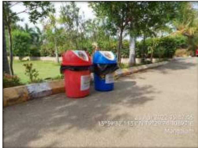
Dust bins along road side