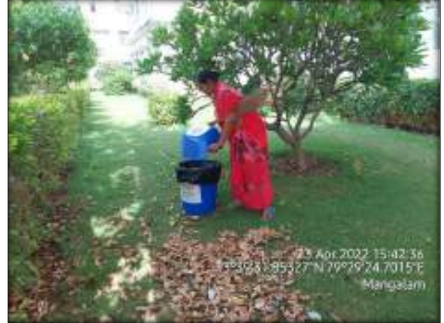
Sweeping and Collection of Dust and Fallen Leaves into the Dust Bins