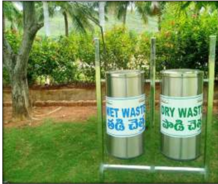
Dust bins at Open Auditorium