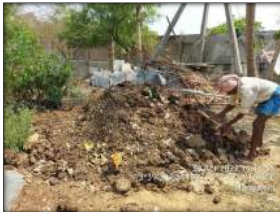
Mixing of Cow Dung and Dried Leaves and Trimmings