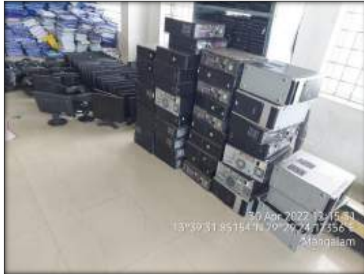
E-waste Storage Facility