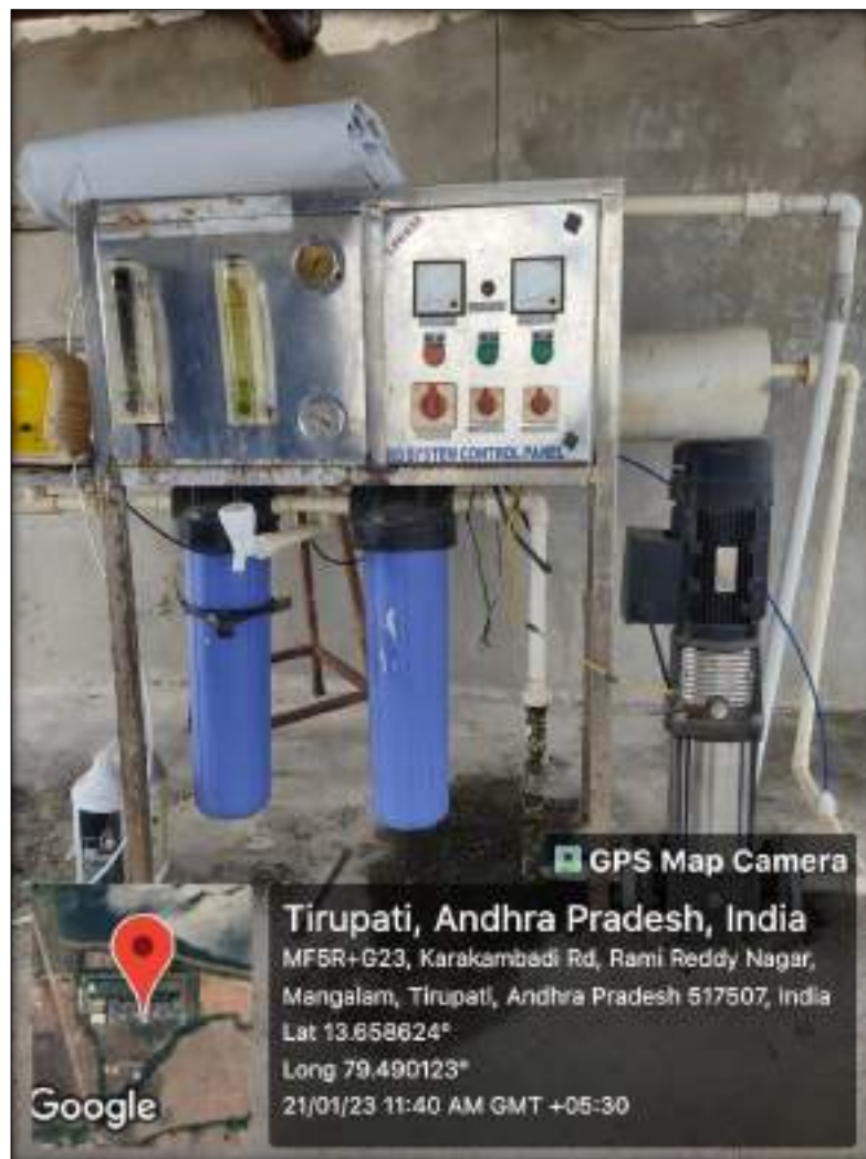
Reverse Osmosis (RO) System at 3 rd floor