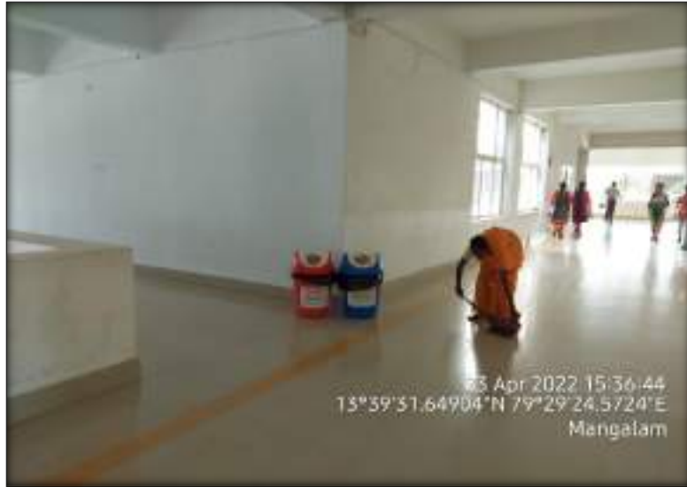
Dustbins at Corridors