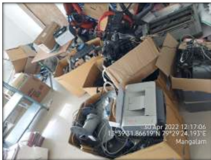
E-waste Storage Facility

The E-waste is disposed to R. M. Computers, Chennai an authorized Dismantler who recycles the materials.