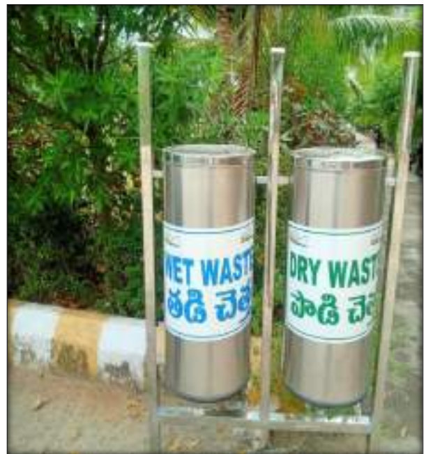
Dust bins at Canteen and at the Entrance