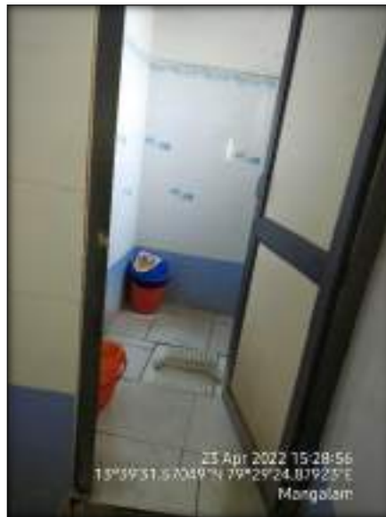
Dustbins at Toilets