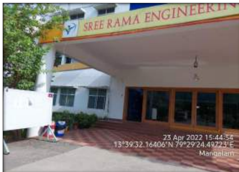
Dust bins at the Main Entrance