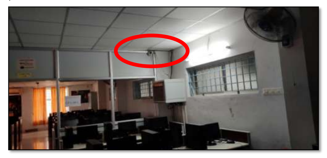
CC Cameras installed in Laboratory

In order to thoroughly ensure the safety of all the inmates of the campus and girl students in particular, CC cameras are installed at almost all the prominent places on campus, corridors etc