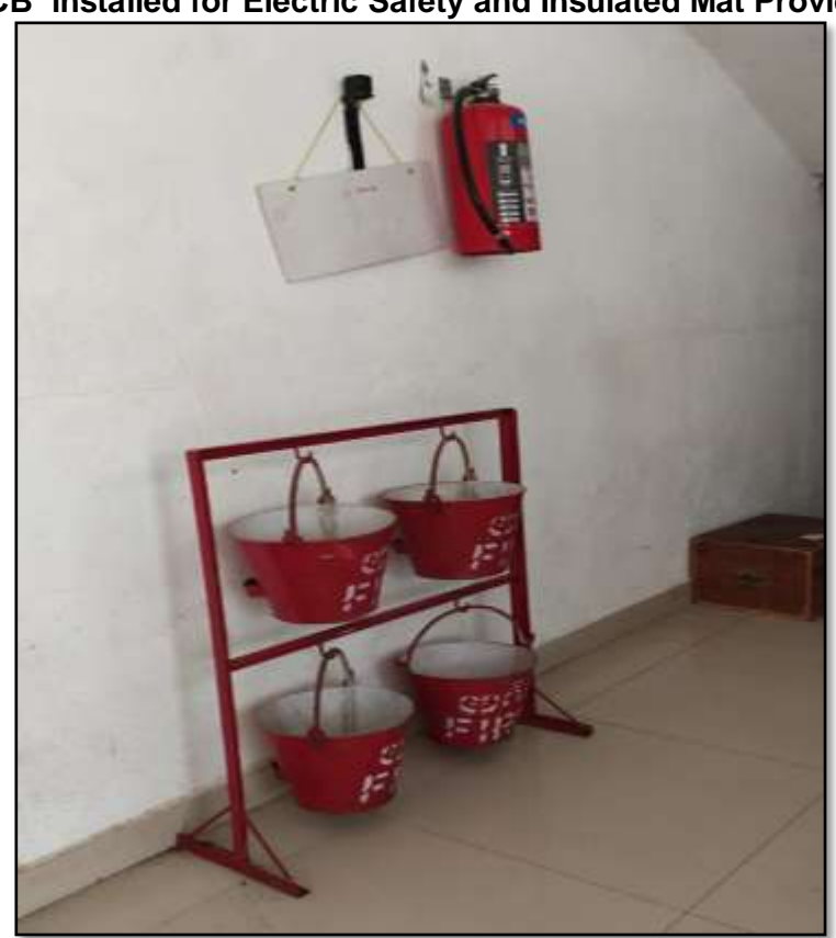
Fire Extinguisher and Sand Buckets for Fire Safety