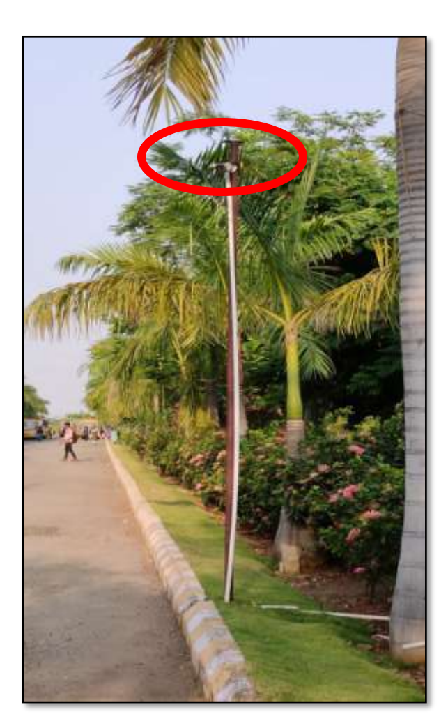
CC Cameras installed at the Main gate