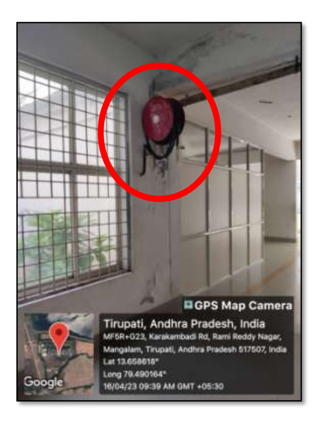
Firefighting equipment in Ground Floor