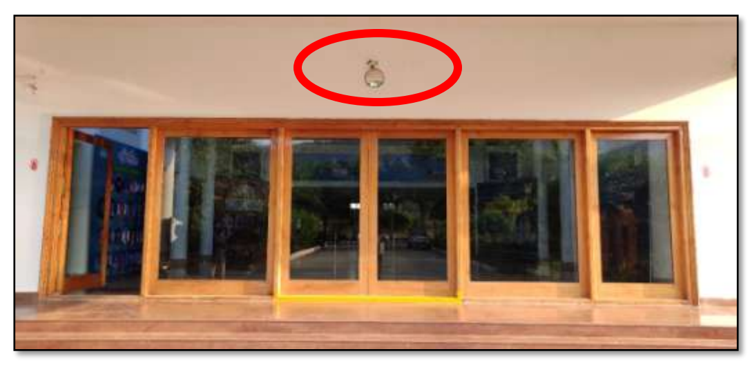
CC Cameras installed at the entrance of the College