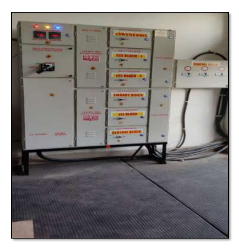
MCB' installed for Electric Safety and Insulated Mat Provided