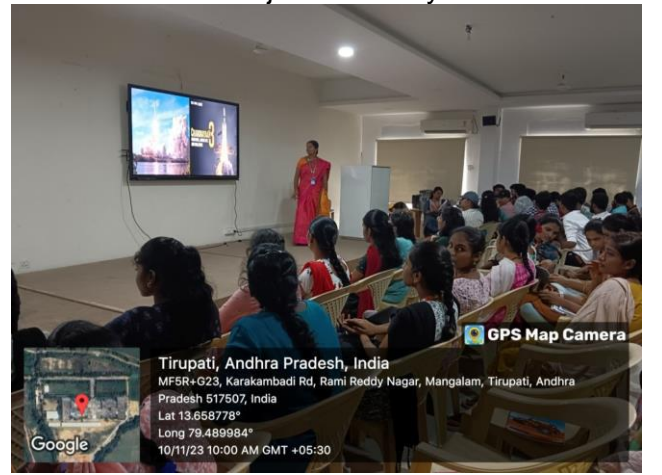
A Seminar On "World Science Day For Peace And Development" Organized By BS&H Department