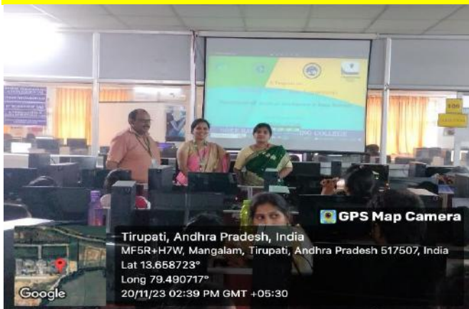
A Technical Quiz conducted by AI&DS department