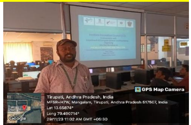
A One Day Workshop On "Problem Solving & Ideation" organized by CSE department