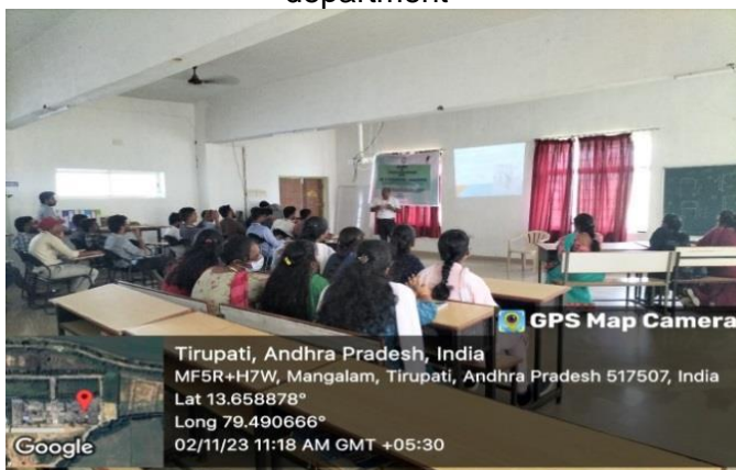
A Guest Lecture On Combined Role of ME & Civil in Distinct Fields organized by ME department