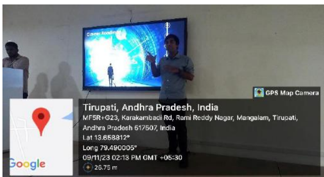
A Seminar on "Career Development towards IT sector" organized by CSE department