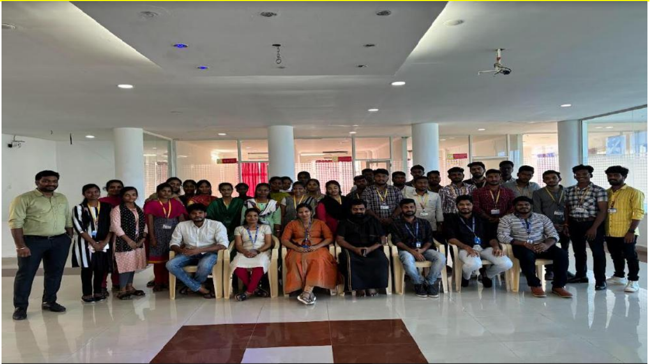
27 Students of SRET placed in Sunny Opotech India Pvt. Ltd., with 2.4 LPA