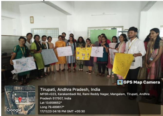
Students participating in poster presentation