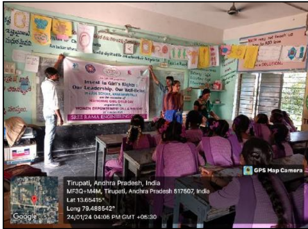
Student volunteers of SRET was discussing on importance of education to ZPH school Annaswampalle