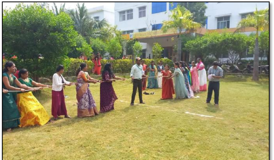
Tug of War for Girls