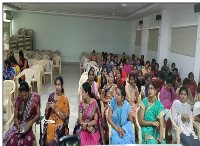
Online Conference on “Women in the workforce for Viksit Bharat”