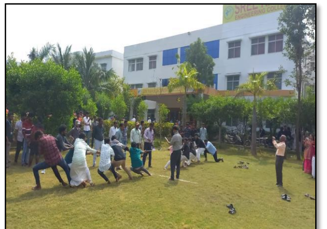
Tug of war for Boys