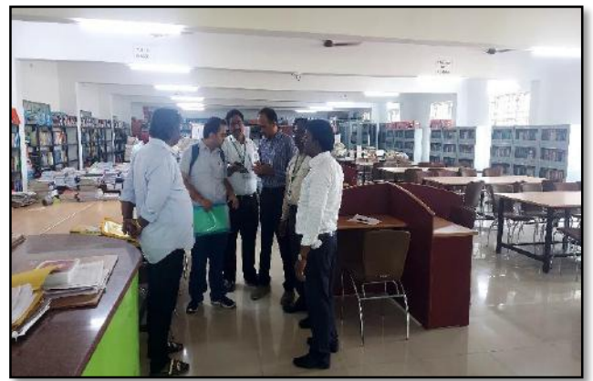
Academic & Administrative Audit team was verifying the Library resources