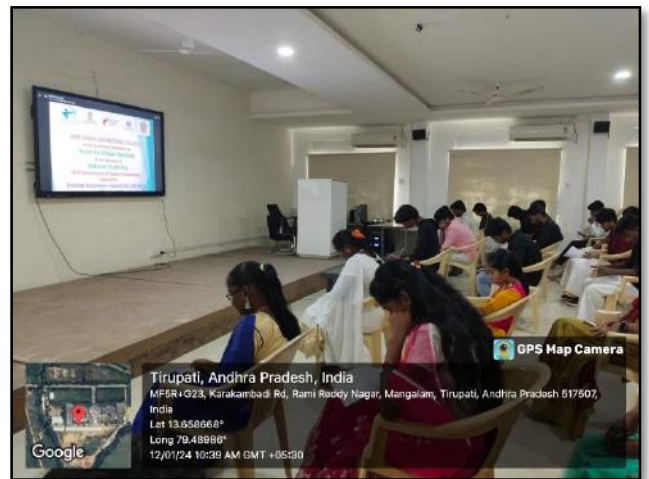
Students has participated in Essay writing competition on the occasion of national youth day