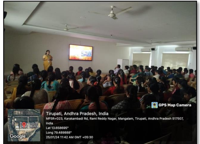
Interaction of New Voters with Honourable Prime Minister Sri Narendra Modi organized under IIC cell in association with NSS unit of SRET