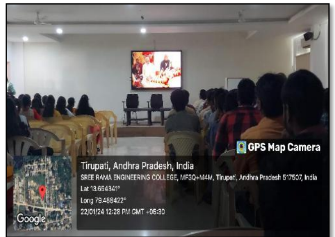
SRET staff and students were taking part in the celebration of Ayodhya Ram Temple's Inauguration