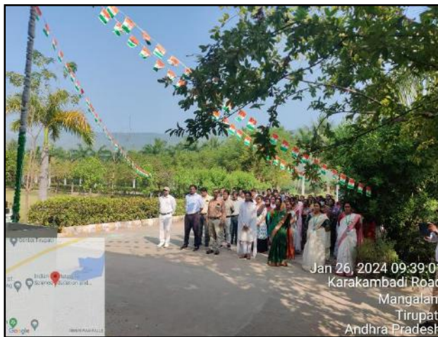
Faculty have gathered on the occasion of Republic day celebrations