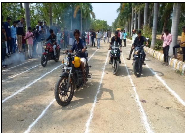
Slow Bike race for Boys