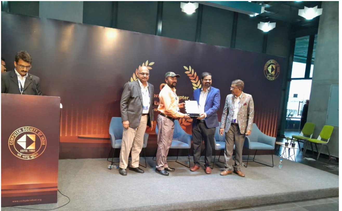
Sree Rama Engineering College got Best Emerging Student Branch in Computer Society India (CSI) Hyderabad chapter Excellence Awards 2023