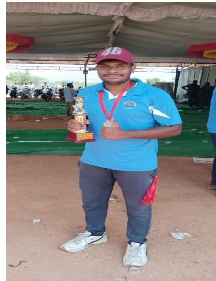
Man of the Match in the final match of YSR cricket tournament

NPTEL online Courses cleared by the students of Sree Rama Engineering College, Tirupati