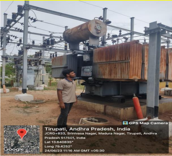
Carriage Repair Shop at Renigunta