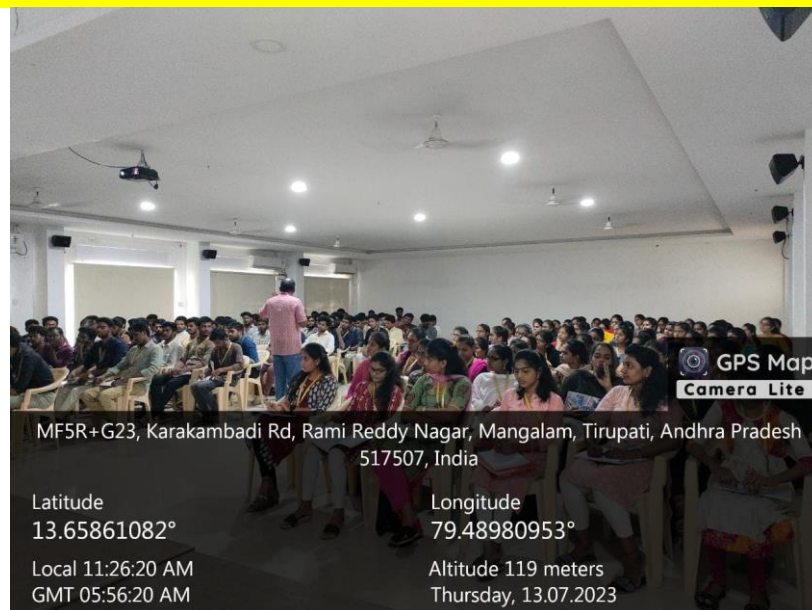
Placement Training Programme for III B. Tech Students