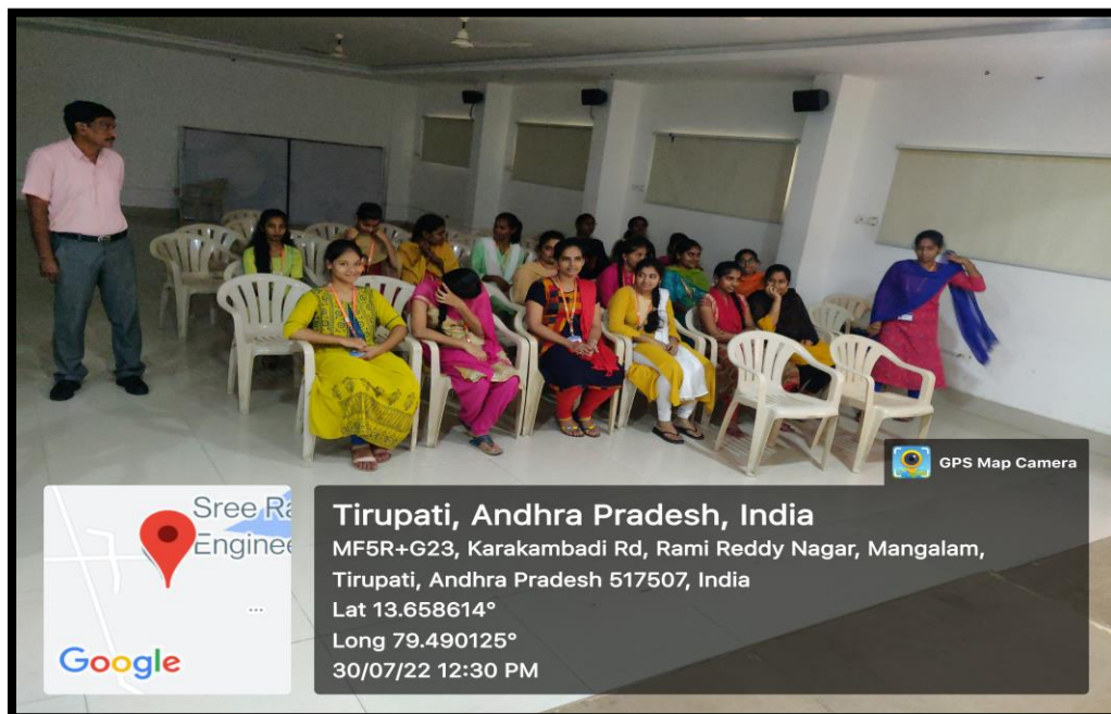
An Add-on course on verbal communication for I B.Tech CSE students