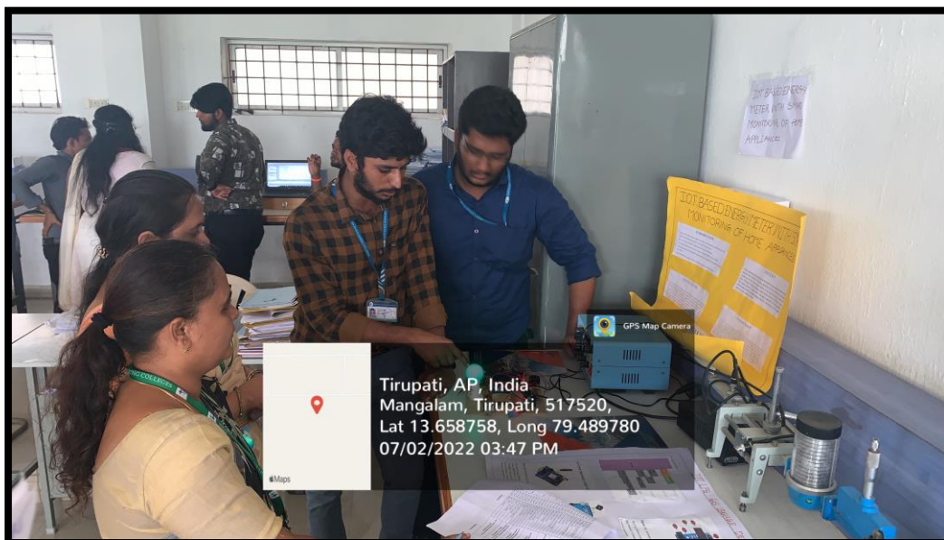
Demonstration of a model by students in project expo competition held on 2 nd July 2022