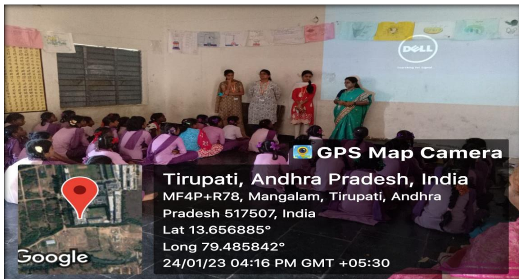
Republic Day celebrations in Sree Rama Engineering College, Tirupati