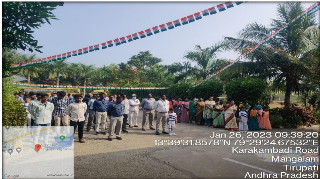
Republic Day celebrations in Sree Rama Engineering College, Tirupati