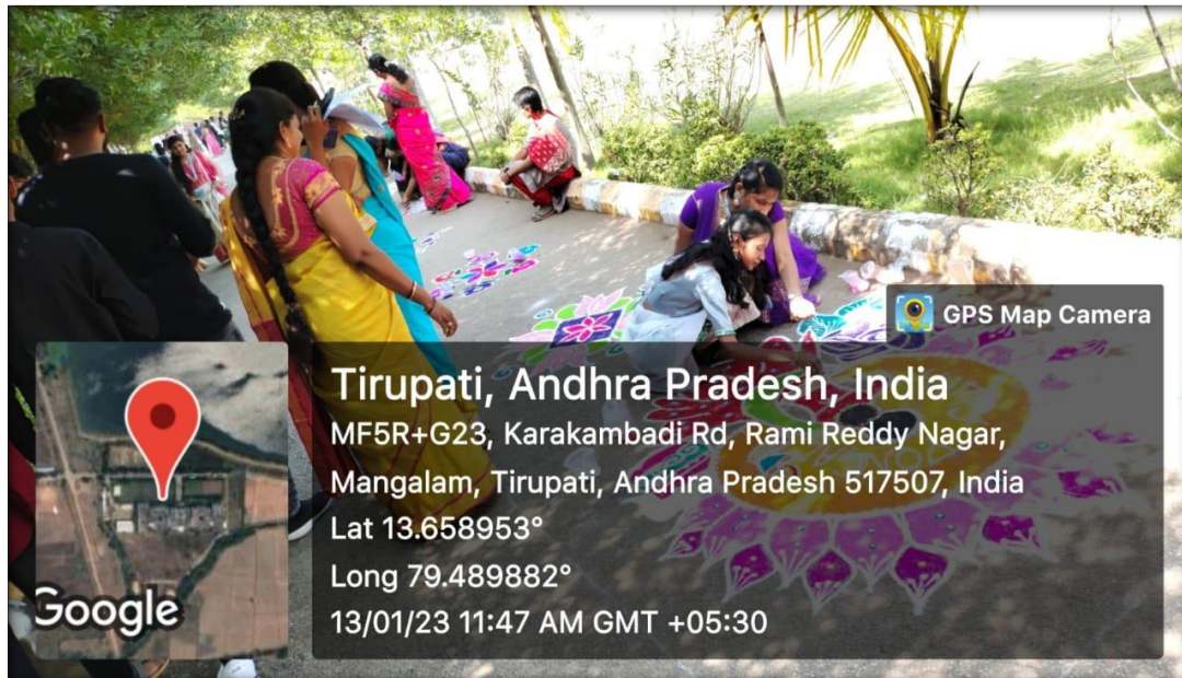
Rangoli competition on the occasion of Sankranthi festival in SREC, Tirupati