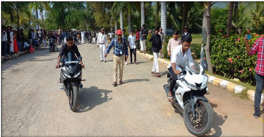
Slow Byke Race competition on the occasion of Sankranthi festival in SREC, Tirupati