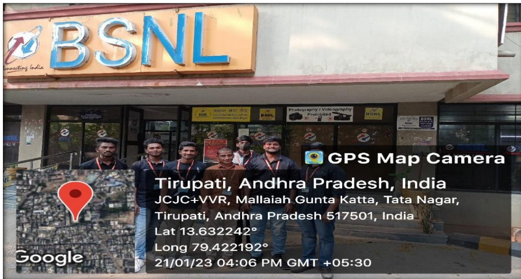
Department of CSE conducted an industrial Visit to BSNL office, Tirupati