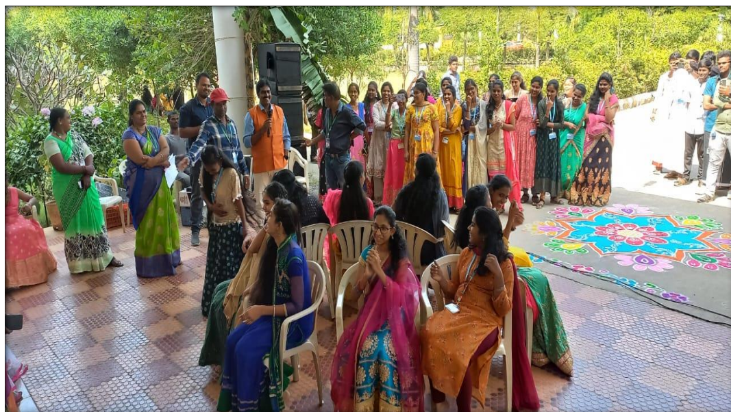
Musical Chairs competition on the occasion of Sankranthi festival in SREC, Tirupati