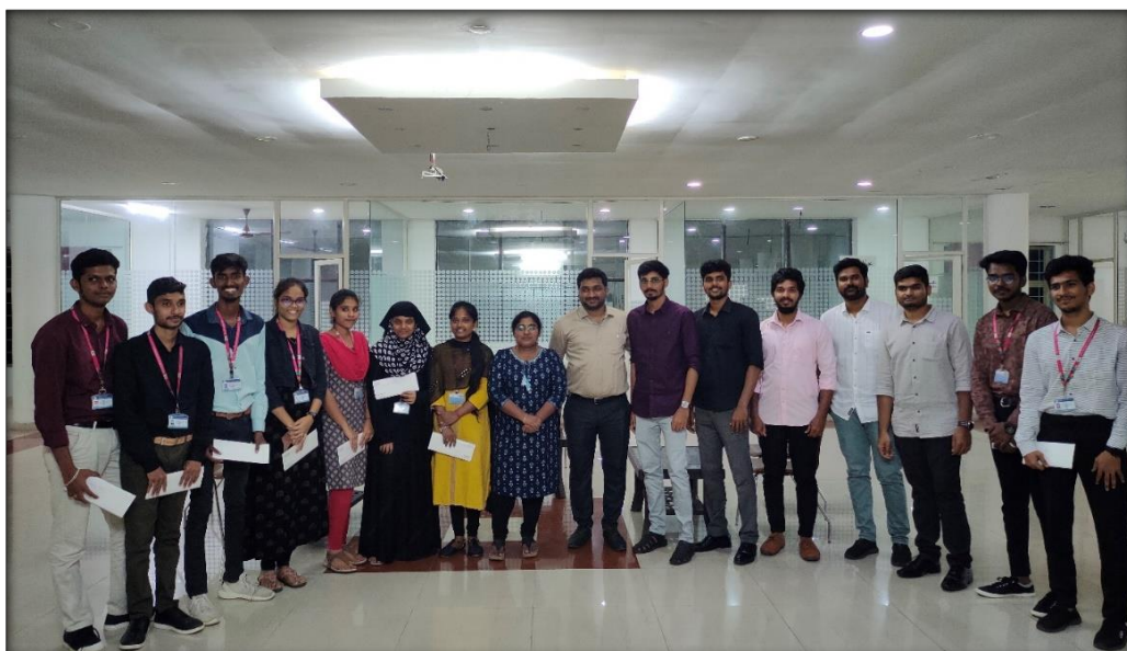
Training & Placement Cell of SREC, Tirupati conducted On-Campus drive on 18 th January 2023, 9 students placed in Market Simplified with 4.5 LPA