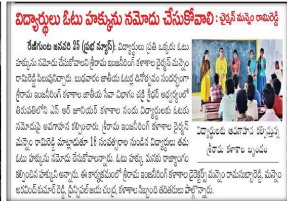
NSS volunteers of SREC is encouraging the SR Junior college students on the importance of vote