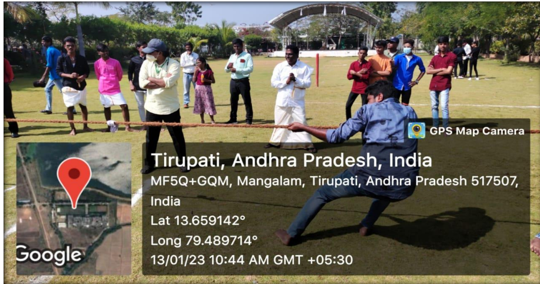
Tug of war competition on the occasion of Sankranthi festival in SREC, Tirupati