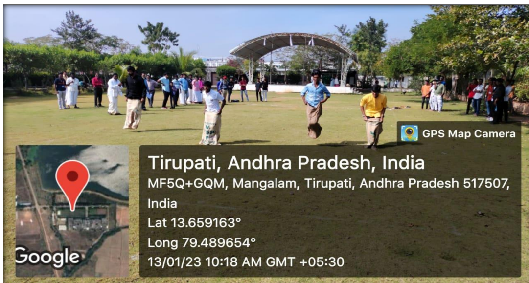
Sake Race competition on the occasion of Sankranthi festival in SREC, Tirupati