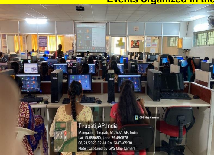
Students participated in a webinar