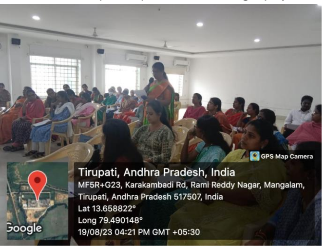
A role play activity with faculty members in a workshop on Conflict Management