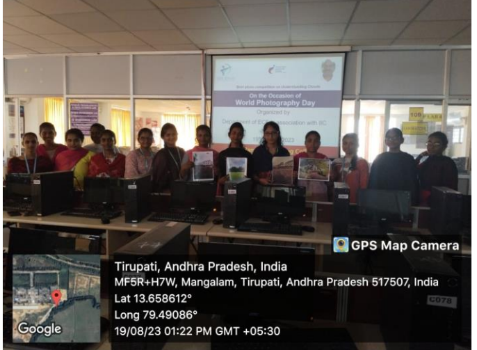
Students participated in Photography