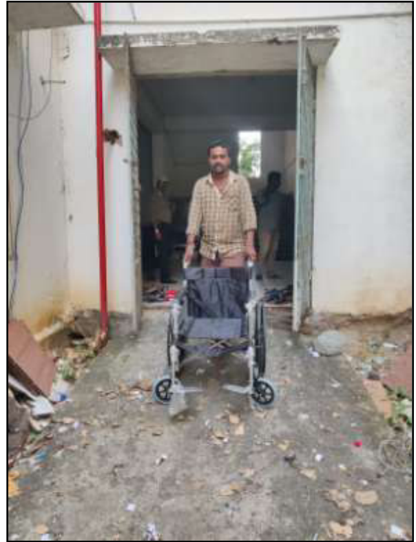
Wheel Chair and Ramp Facilities