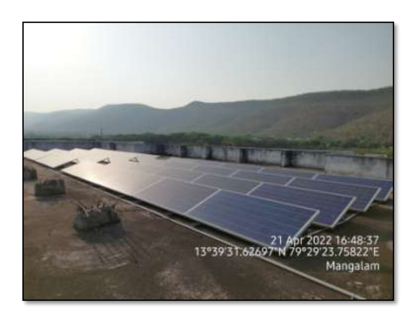
Solar Rooftops in the College Building

Rami Reddy Nagar, Karakambadi road, Tirupati-517507