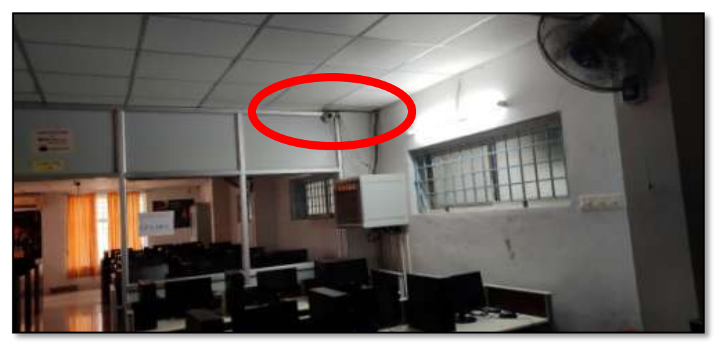
CC Cameras installed in Laboratory

In order to thoroughly ensure the safety of all the inmates of the campus and girl students in particular, CC cameras are installed at almost all the prominent places on campus, corridors etc