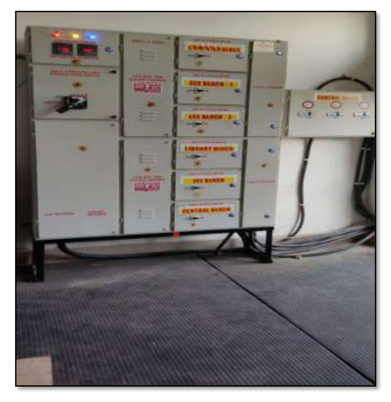
MCB' installed for Electric Safety and Insulated Mat Provided