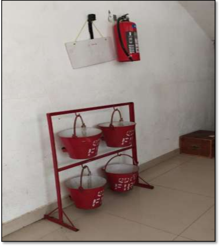
Fire Extinguisher and Sand Buckets for Fire Safety