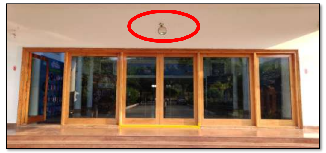
CC Cameras installed at the entrance of the College