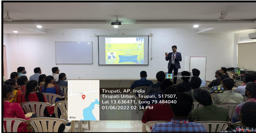
A Seminar on “Upgrading opportunities Traditionally – Technically with management”