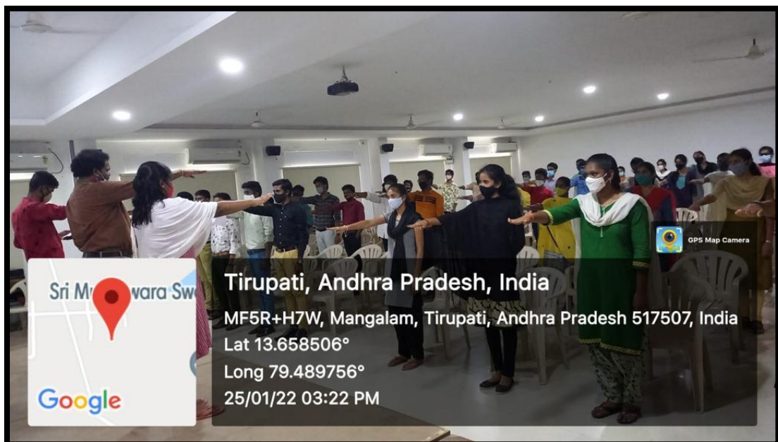
Pledge to Vote on the occasion of National Voters Day celebrations