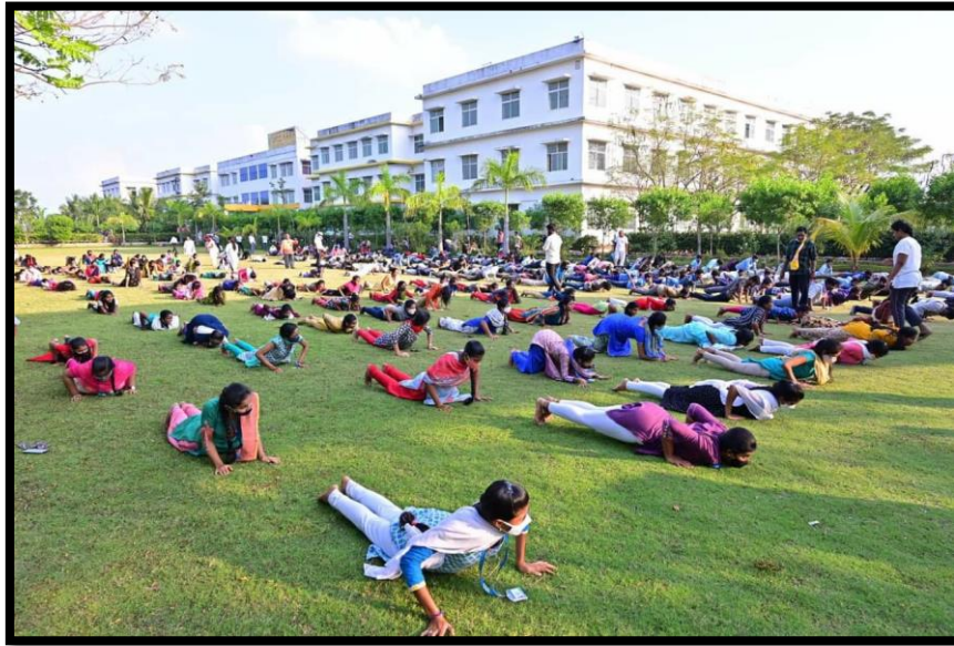
75 crore surya namaskar