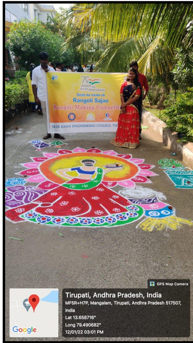
Rangoli Sajavo Desh ke naam ek rangoli sajavo in view of Azadi ka Amrutmahostav