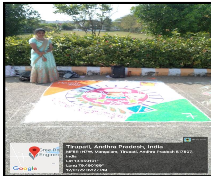
Rangoli Sajavo Desh ke naam ek rangoli sajavo in view of Azadi ka Amrutmahostav