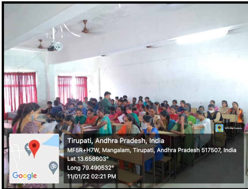
A Quiz Competition Program