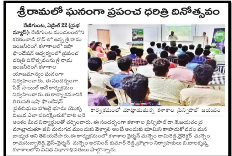
Newspaper article about the celebration of World Earth Day in SRET, Tirupati