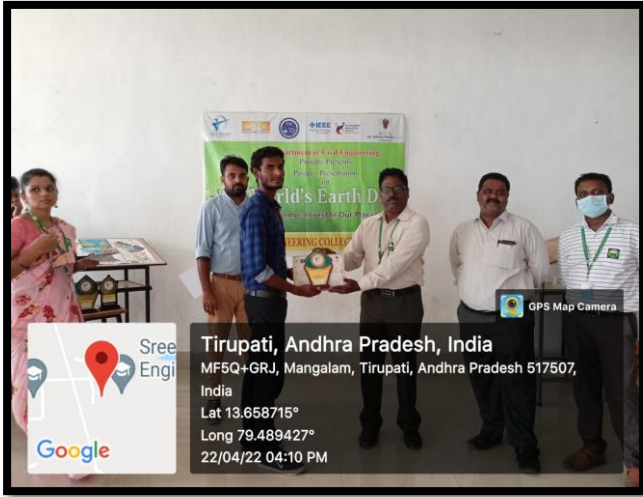
The Prize distribution for the students who won prizes in poster presentation by Principal, SRET