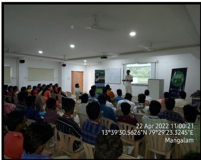
A seminar on Save Soil