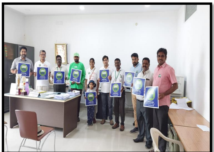
SRET follows Save Soil concept with Isha Foundation