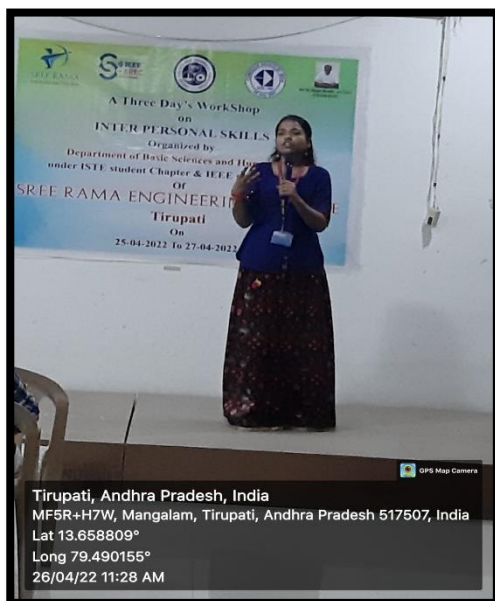
An activity of Student in three day workshop on Interpersonal skills