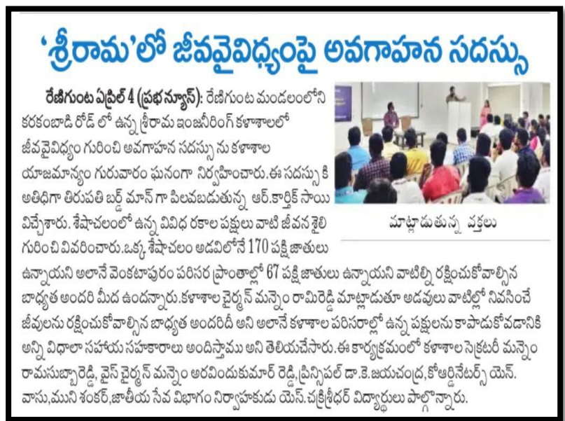
Newspaper article about the NSS workshop on Biodiversity conservation in Seshachalam Forest